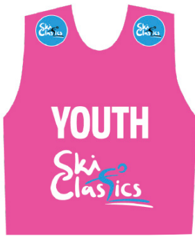
YOUTH BIB Pink PMS neon 806