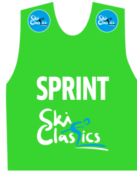
SPRINT BIB Green PMS neon 802