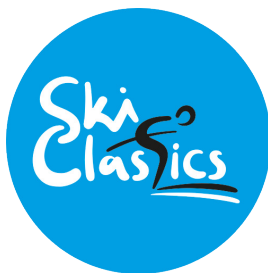
SKI CLASSICS LOGO Pantone Process Cyan C