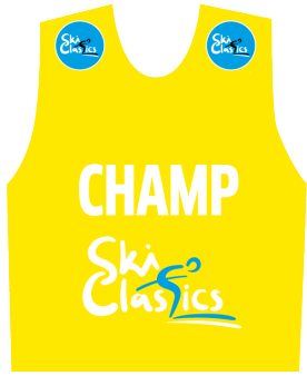
CHAMPION BIB Yellow PMS neon 803