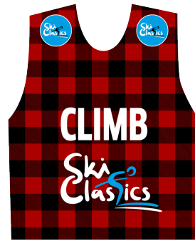
CLIMB BIB Red PMS P 48-8 C Black PMS Black C