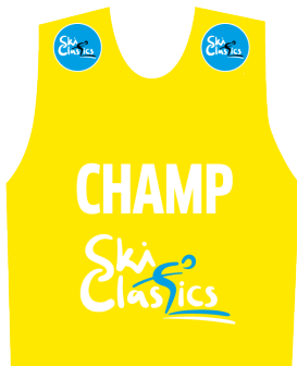
CHAMPION BIB Yellow PMS neon 803