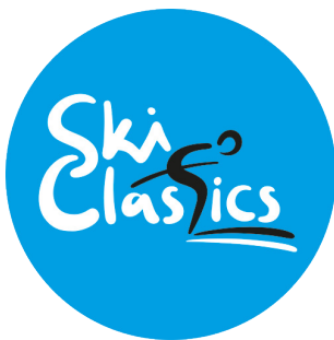
SKI CLASSICS LOGO Pantone Process Cyan C