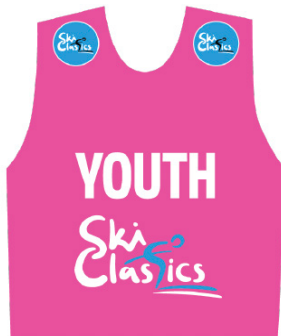
YOUTH BIB Pink PMS neon 806