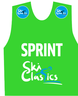
SPRINT BIB Green PMS neon 802