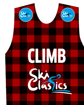
CLIMB BIB Red PMS P 48-8 C Black PMS Black C