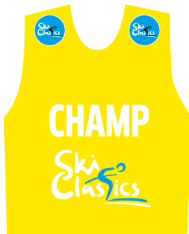
CHAMPION BIB Yellow PMS neon 803