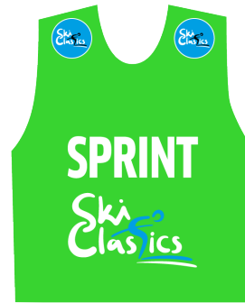
SPRINT BIB Green PMS neon 802