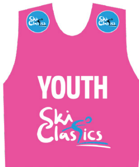
YOUTH BIB Pink PMS neon 806