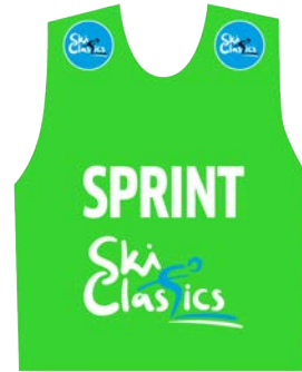
SPRINT BIB Green PMS neon 802