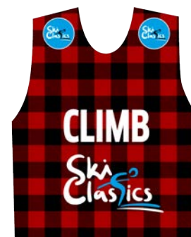
CLIMB BIB Red PMS P 48-8 C Black PMS Black C