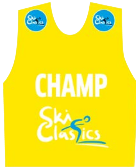
CHAMPION BIB Yellow PMS neon 803