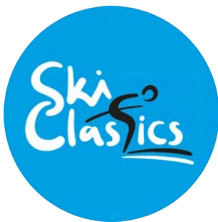
SKI CLASSICS LOGO Pantone Process Cyan C