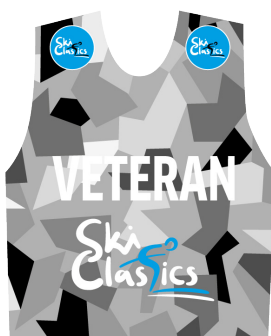
VETERAN BIB Pattern range from 10% to 100% black