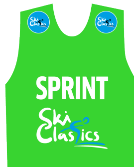
SPRINT BIB Green PMS neon 802