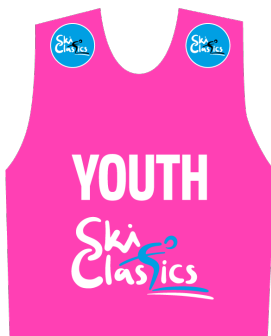
YOUTH BIB Pink PMS neon 806