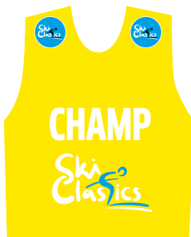
CHAMPION BIB Yellow PMS neon 803