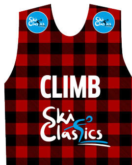
CLIMB BIB Red PMS P 48-8 C Black PMS Black C