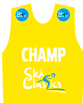
CHAMPION BIB Yellow PMS neon 803