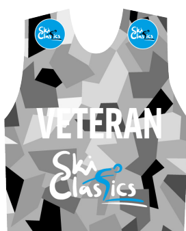
VETERAN BIB Pattern range from 10% to 100% black